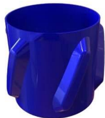
Single Piece Type